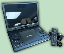
14.9" PORTABLE DVD PLAYER WITH REMOTE