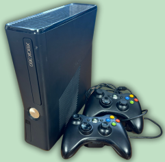
XBOX 360 TYPE S CONSOLE SET