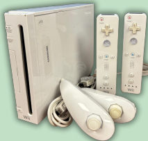
NINTENDO WII CONSOLE